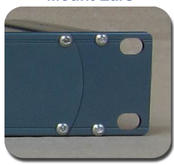
19" Rack Mount Ears

A Signature unit can rack mount in a 1U 19" rack, regardless of the size of the unit. Rack ears are included as standard with every unit.