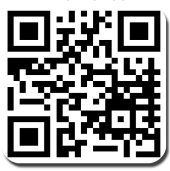
Quick Find Manual

A Signature unit has a QR code attached. This can be scanned to simply and quickly locate the manual and technical information.