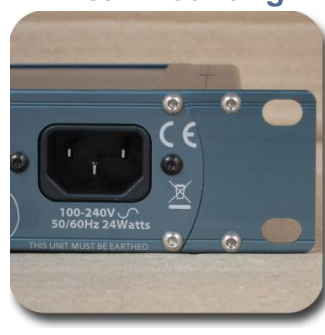
Front Or Rear Mounting

A Signature unit can be rack mounted via the front panel or if it is more convenient, via the rear panel by simply swapping the rack ears over.