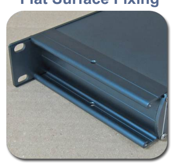
Side Wings For Flat Surface Fixing

A Signature unit has side wings with mounting holes at the top and bottom, allowing flush fixing from above OR underneath.