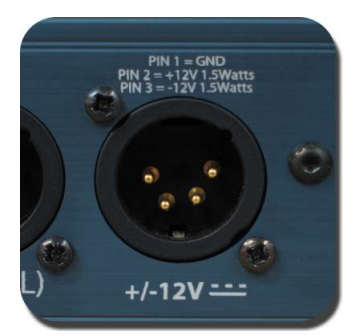
12V DC Power Connection

All Signature units (except PS1) have a 4 pin XLR ±12V DC socket for connection to the PS1 Power Station. This can act as the primary or backup power source.